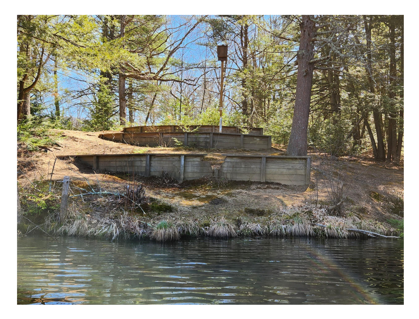
Area 4 - eastern location - confluence of Broad Brook