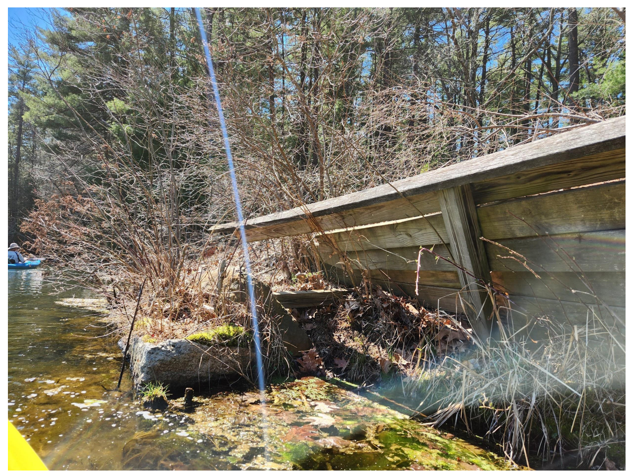
<u>Area 3</u> - east side is across from boat ramp and has damage - vandalism.