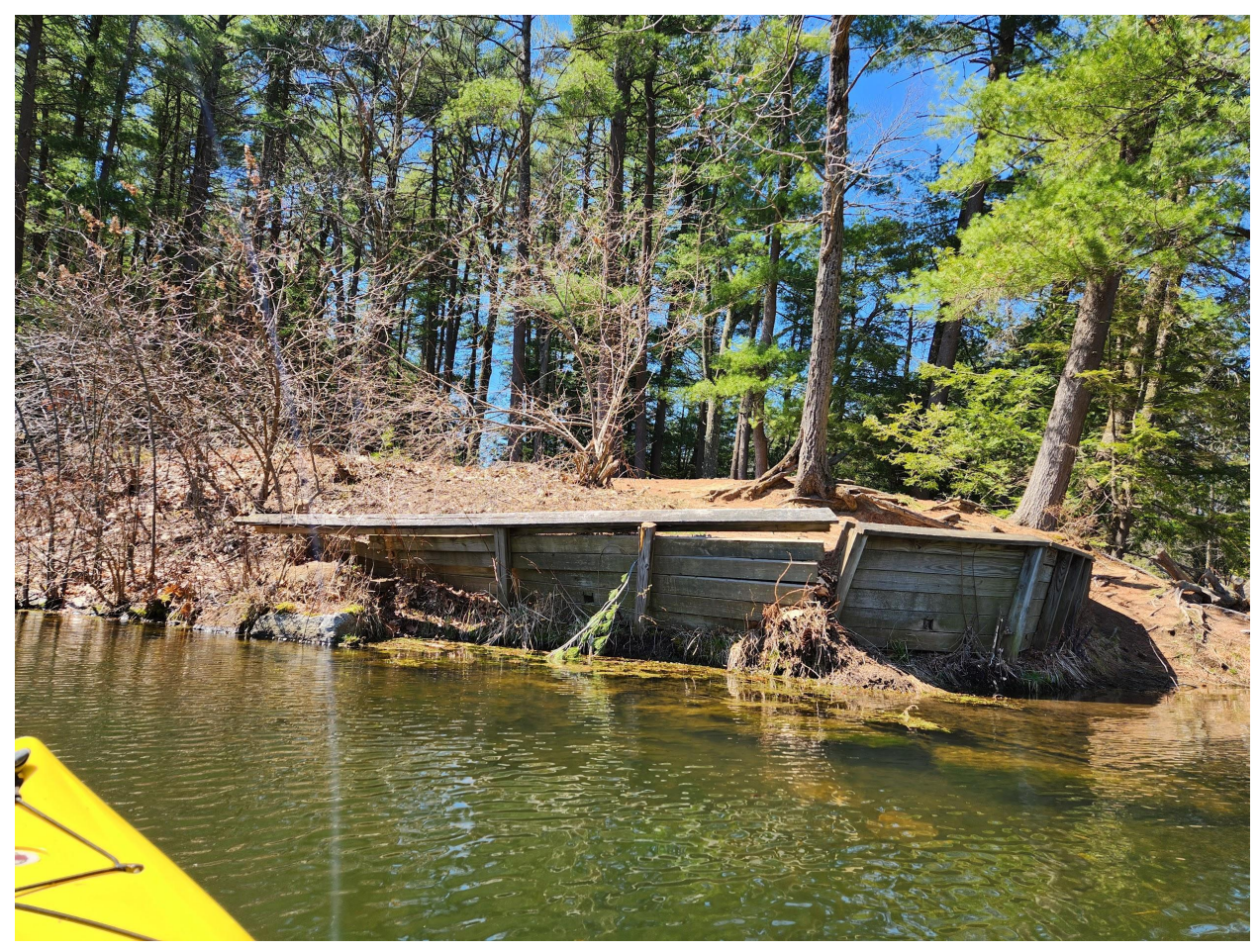
Area 3 East side (1 of 2 area 3's)